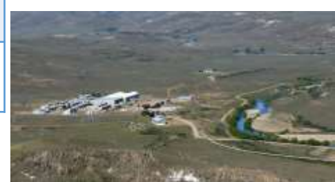
Enrichment Plant Pilcaniyeu