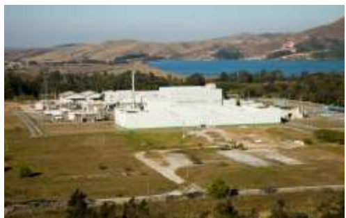
Enrichment Plant INB