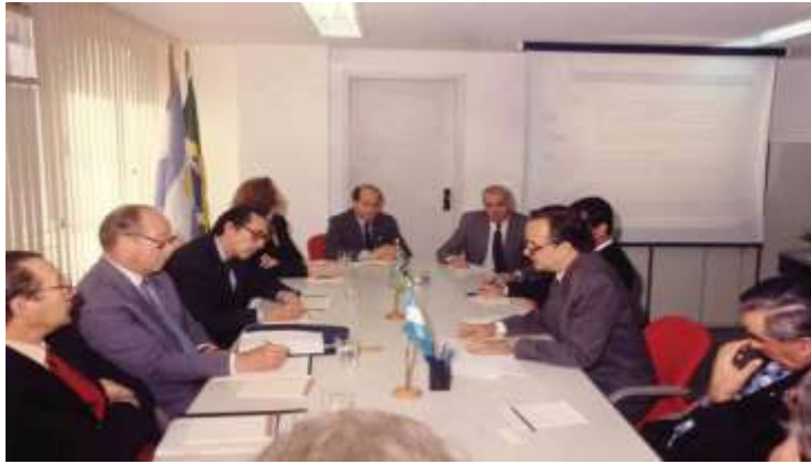
Visit of IAEA Director General Hans Blix in 1997