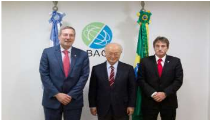
Visit of IAEA Director General Yukya Amano in 2016