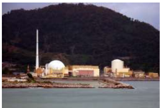
NPPs Angra 1 & 2