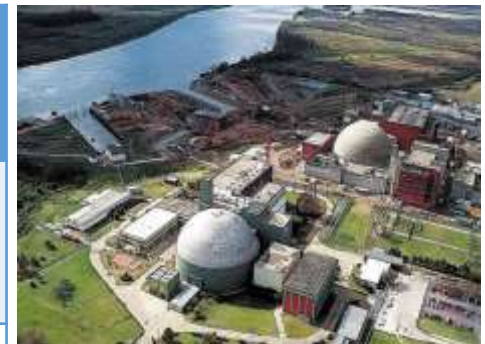
NPPs Atucha 1 & 2

* One facility under construction; ** One designed facility