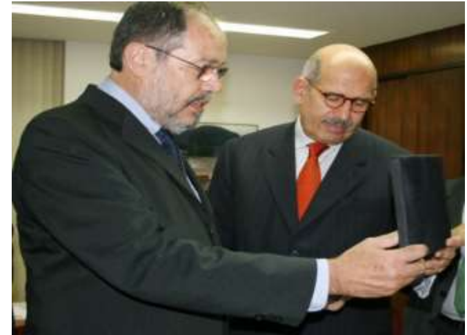
Visit of IAEA Director General Mohamed ElBaradei in 2007