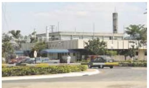
Enrichment Plant LEI