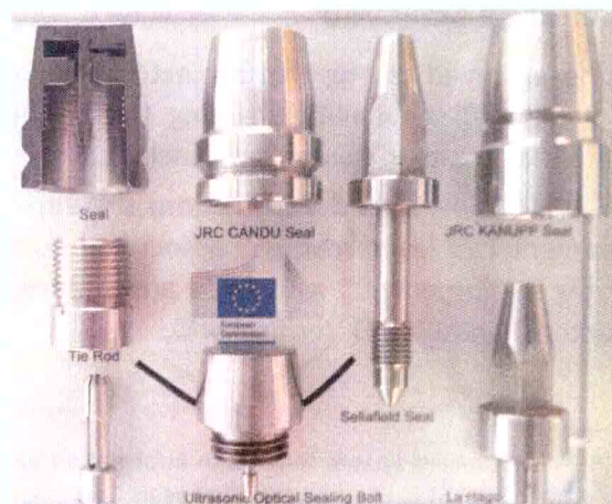
Figure 1: Examples of JRC Ultrasonic Seals.